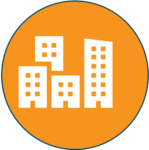
STATE- ASSISTED CONSTRUCTION PROGRAMS