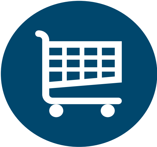
SMALL BUSINESS PURCHASING PROGRAM (SBPP)