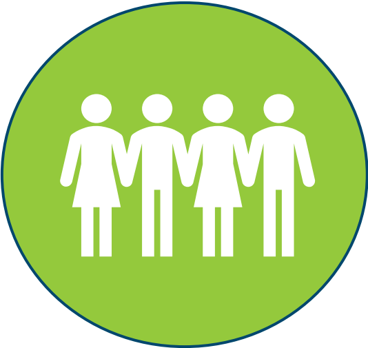
SUPPLIER DIVERSITY PROGRAM (SDP)