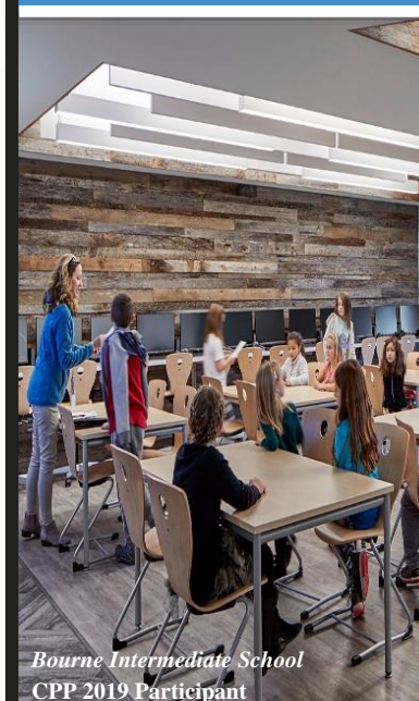
Bourne Intermediate School CPP 2019 Participant

Did you know that classroom furniture makes up on average 34% of the total FF&E actual cost?