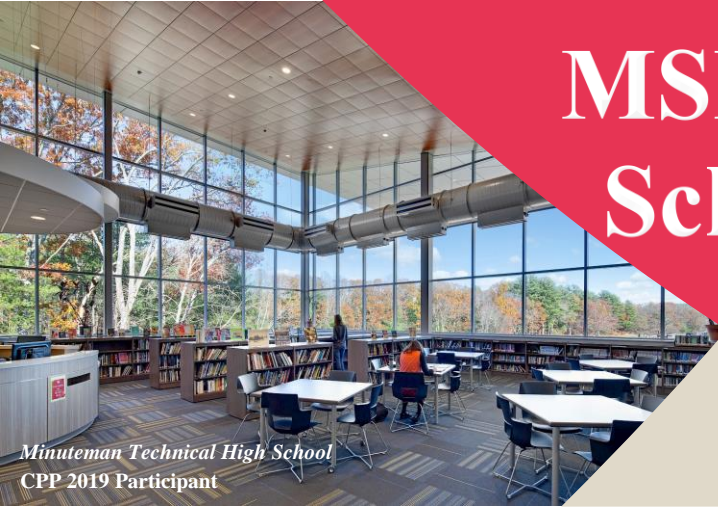
Minuteman Technical High School CPP 2019 Participant